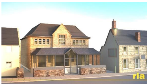
Our original plan for the front of the Community Hub

Following a period of public consultation with the people of Uppingham in December 2014 formal planning permission was sought from Rutland County Council earlier this year for an exciting scheme to redevelop the existing Town Hall building to give us the much needed facilities identified in our Neighbourhood Plan. Whilst initially supportive, Rutland County Council refused part of our planning application which has caused us to have to question the whole viability of the Community Hub project. Basically as the Town Hall is within the Conservation Area our submitted design sought to retain the existing building façade whilst extending the rear area. The Planning Authority passed all of our rear area plans but refused to allow the intended use of glass and steel at the front of the building. The Planning Committee did however indicate that they may be more sympathetic to a stone built frontage that keeps the feeling for the existing building.