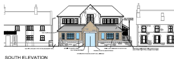
Our revised plan using stone materials

Whilst we have had some amended plans drawn up as requested by the Planning Authority, before we decide whether or not to submit them we want to consult the people of Uppingham once more to ensure that we have the local community with us on this project. Indeed we would like to take this opportunity to seek views not only on the physical design of the building but on the whole idea of