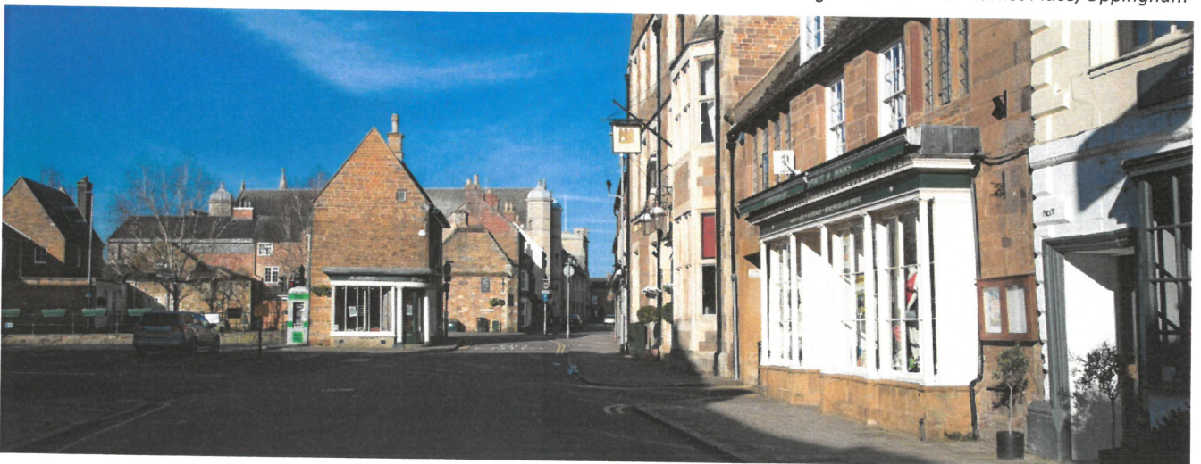
High Street East & Market Place, Uppingham